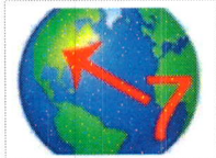
U.S. ranked seventh-worst housing market in the world